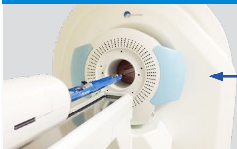
PET/MR up to 9.4T

PET CLIP-ON for Powerscan and Flexiscan CT & MR